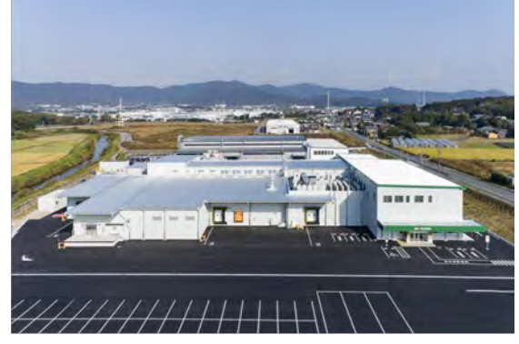
(Working title) New construction of Toyohashi factory of Shokuken Co.,Ltd. (Aichi pref.)